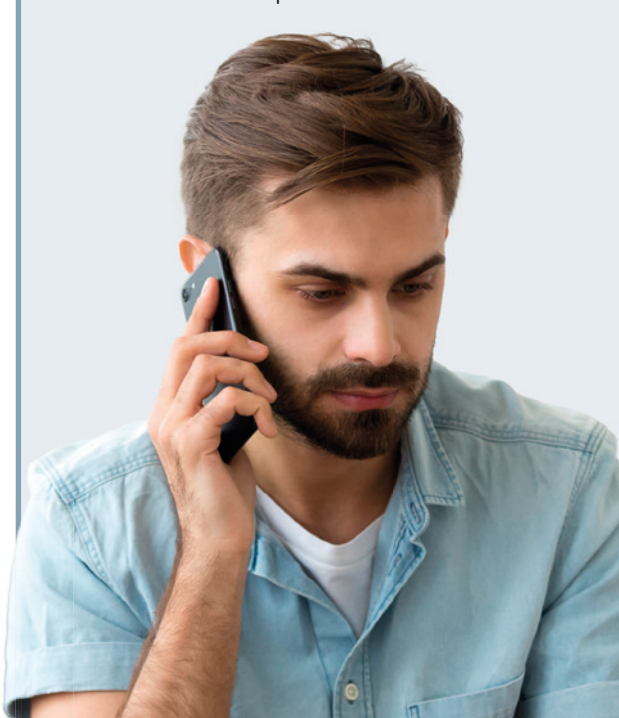
Unity is here to support you. Your voice matters, your feedback helps us do better.

Everyone deserves to live in a safe and peaceful place. Unity Housing is here to help make that happen. If things aren't right, please tell us. We want to help.