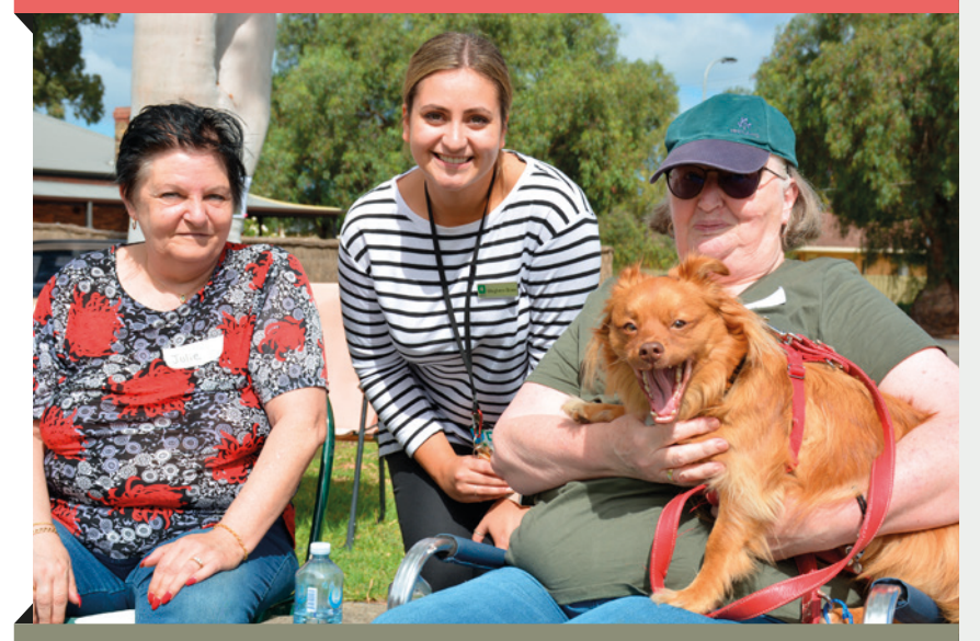
Together, we're shaping a better future.

We're excited to announce the launch of our Tenant Voice Forums – a series of in-person events coming to both metropolitan and regional areas starting in 2025. This roadshow is all about hearing from YOU and making sure your voice shapes the future of Unity Housing's services.