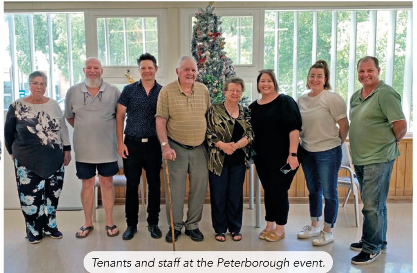
Tenants and staff at the Peterborough event.

Unity hosted a lovely lunch for eight tenants in Peterborough on 17 December and for our tenants at The Terrace Boarding House on Christmas Day.