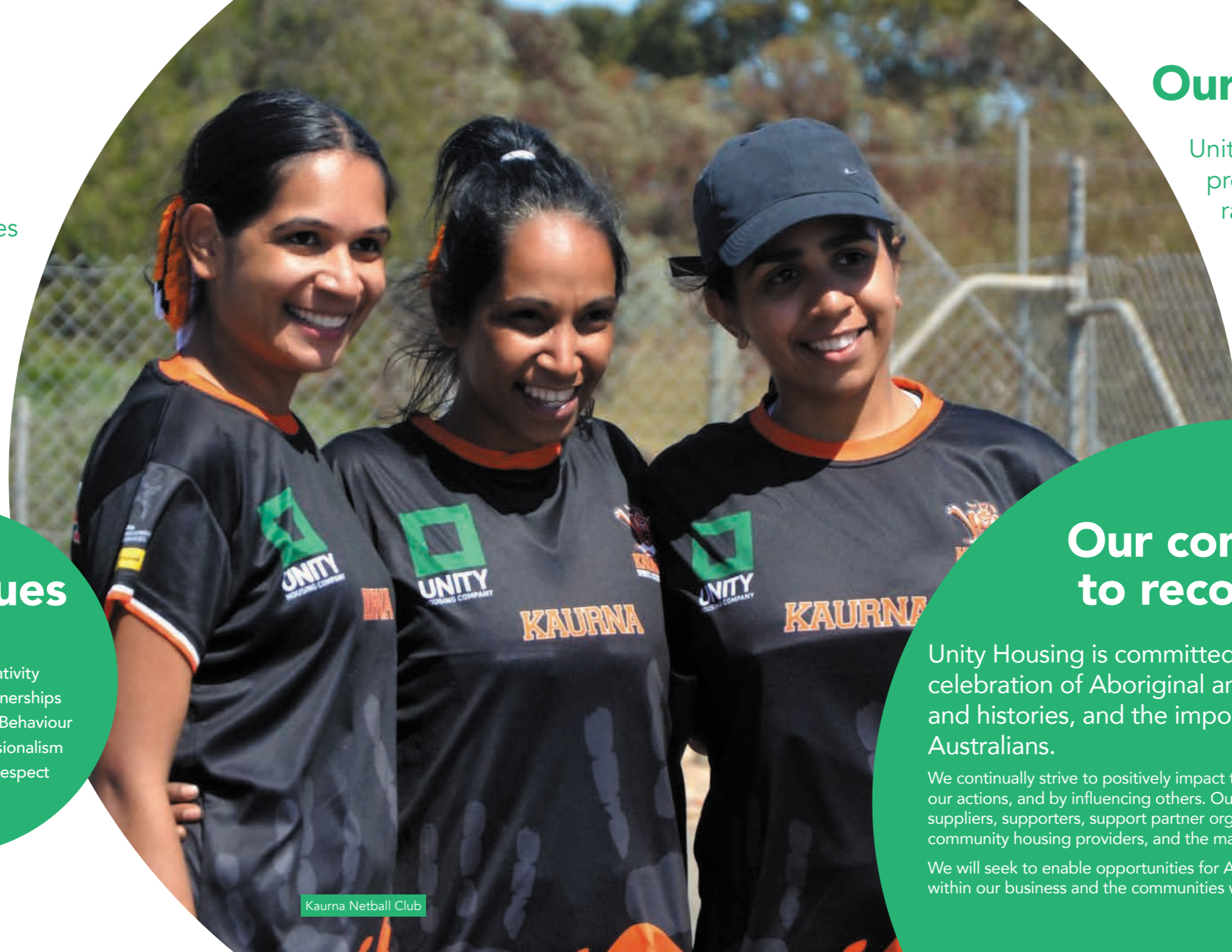
Kaurna Netball Club