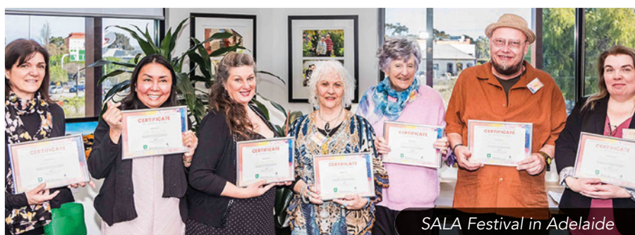
SALA Festival in Adelaide