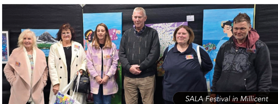
SALA Festival in Millicent

RECEIVE YOUR EDITIONS OF AROUND THE HOUSE BY EMAIL