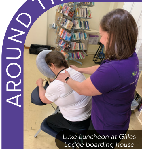
Luxe Luncheon at Gilles Lodge boarding house