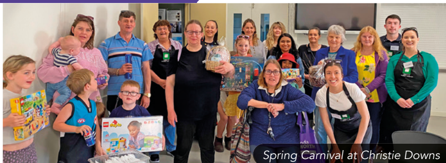
Spring Carnival at Christie Downs