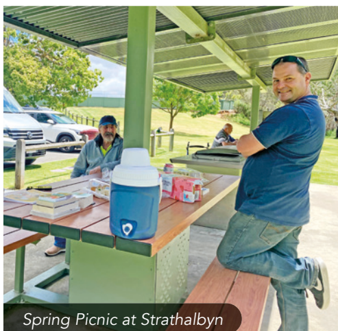
Spring Picnic at Strathalbyn