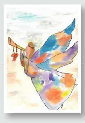
DM Second Place