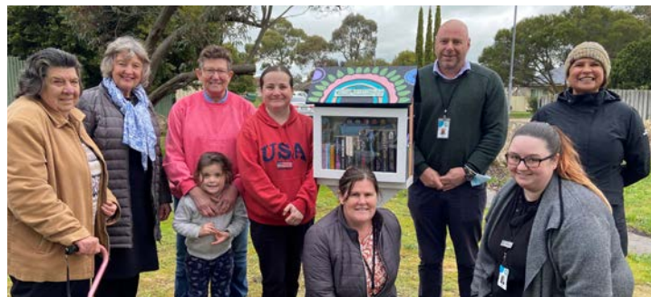
Wardle Crescent park, Naracoorte