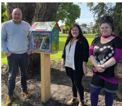
Lions Park, Millicent