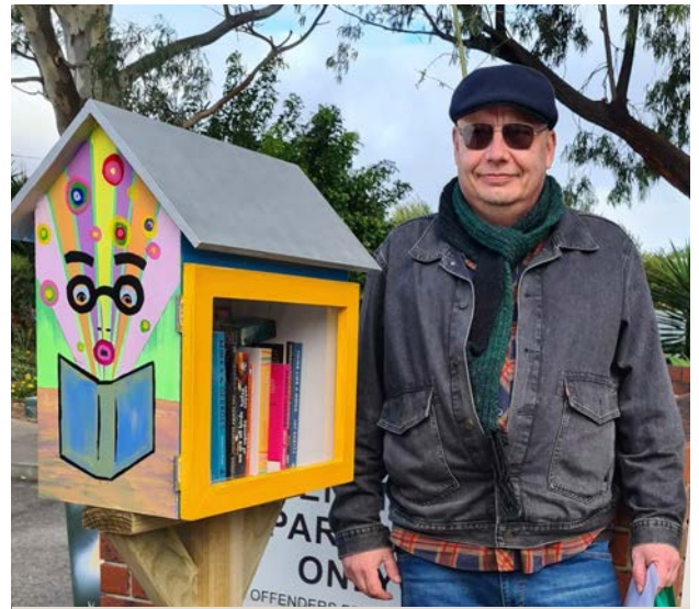
Morse Court, Fulham Gardens

All the libraries are full of books and residents have been spotted taking and exchanging books already.