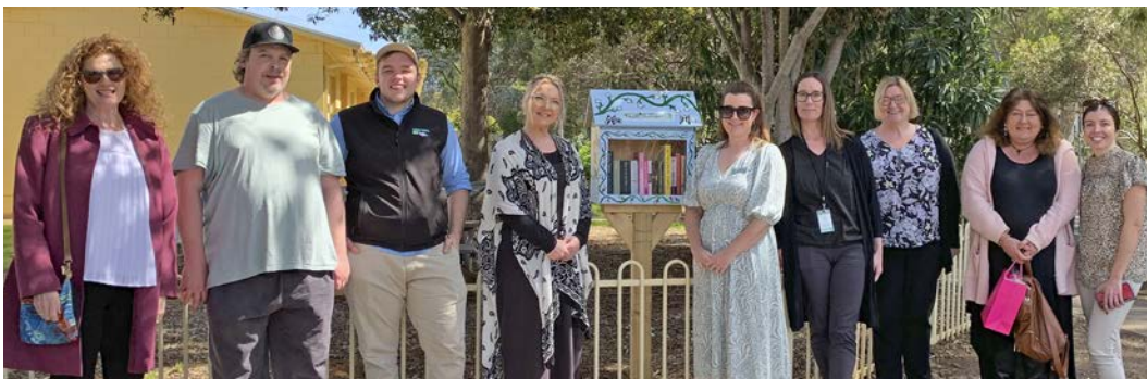
Avalon Street, Marion