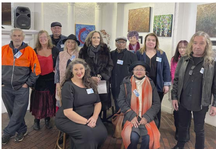
Some of this year's exhibiting tenant and staff artists at the opening night of our SALA Festival exhibition.

We are very proud of all creative achievements and thank everyone who came out to support the artists and enjoy these wonderful exhibitions. Art is definitely alive and well in our community!