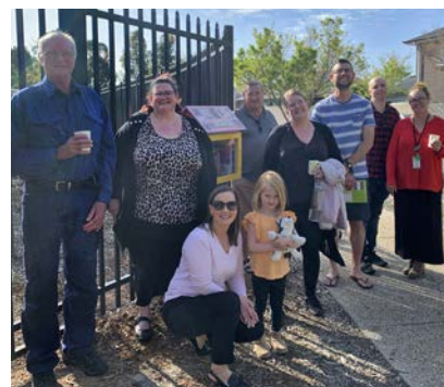
Cameo Street, St Clair