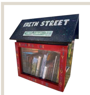
Edith Street, Peterborough