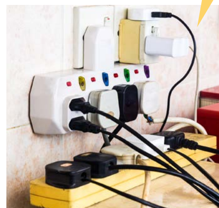
Using multiple electricity plugs and an overloaded outlet increases the risk of a fire in your home.

Plugs and cords should only ever be replaced by a licensed electrician as with repairs to any electrical equipment. Immediately report any sparking or tingling from light switches, power points or light fittings to your Housing Officer.