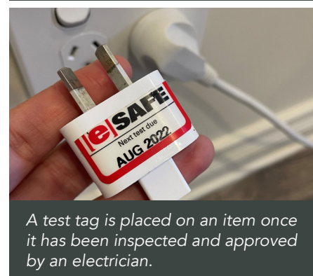
A test tag is placed on an item once it has been inspected and approved by an electrician.

If you have any questions or would like to talk about any of this information in more detail, please contact your Housing Officer.