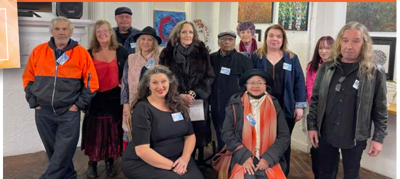
Some of the participating artists at the launch of our SALA Festival exhibition at Café Outside the Square on 5 August.

SALA Festival is once again turning our beautiful state into one big gallery. It is the largest community-based, visual arts festival in Australia and our ever-growing online and gallery exhibitions feature mixed medium artworks by 20 established, emerging and hobbyist tenant and staff artists.