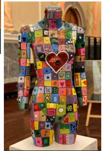
3D sculpture by Mandy