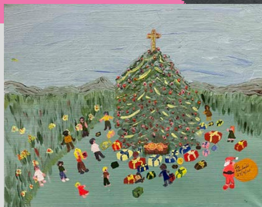
'Meaning of Christmas'