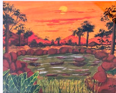
Some of the artwork by our tenants that was exhibited in this year's SALA Festival.