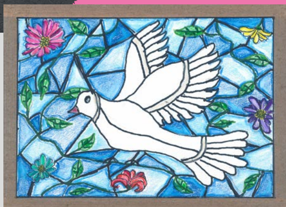
'Peace is the Ultimate Gift'

"I wanted to demonstrate an image that displayed love as well as a sense of peace and calming. My main inspirations were love, giving, freedom and peace." – Jody