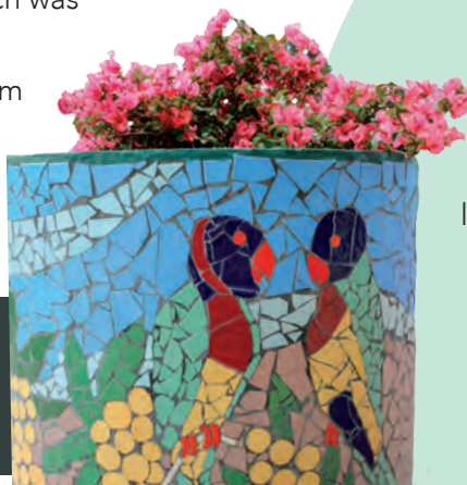
Art pieces are featured around the centre, created by members of the art group.

The feedback received from tenants was they were pleasantly surprised with the range of activities happening at the centre.